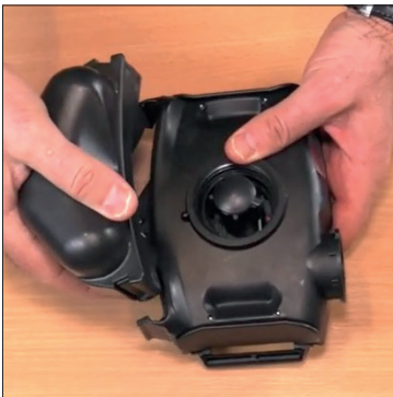
1. Connect a fully charged battery to the blower unit, sliding it into place.

Always visually inspect parts before assembling. This guide presumes that filters are new, batteries are charged, and that parts are clean and dry.