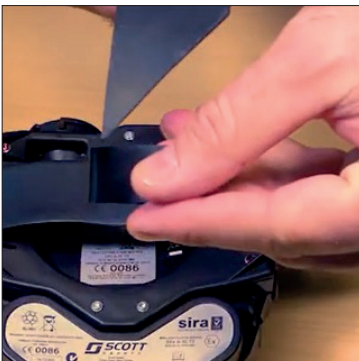
4. Slide the belt hoop onto the thin end of the strap.