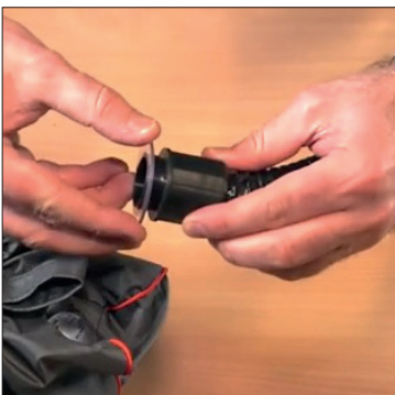
7. On the other end of the hose, place a clear plastic washer.