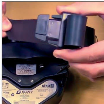
5. Thread the buckle onto the strap from back to front.