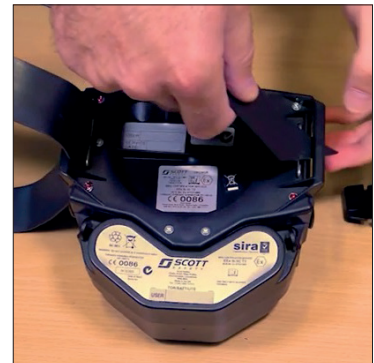
3. Thread the belt strap through the slits on the back of the unit as shown.