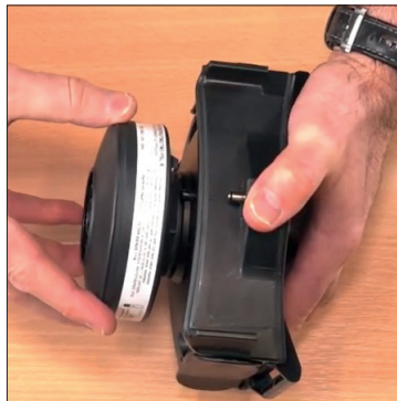
2. Screw a compatible P3 filter onto the unit until you hear a 'snap'.